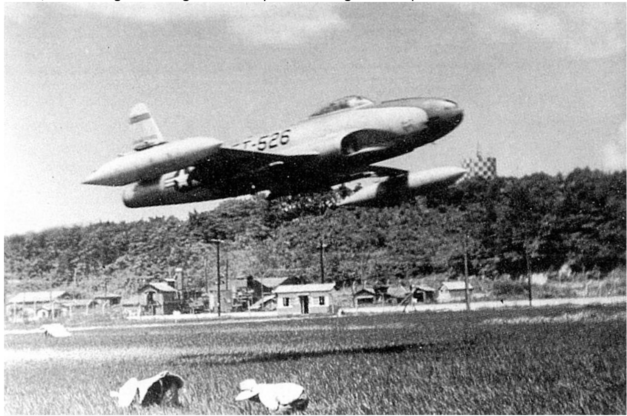
7th Fighter-Bomber Squadron F-80C taking off from Itazuke AB

25 June 1950 With the outbreak of hostilities in Korea, the unit assisted in flying cover missions for the evacuation of civilians from Kimpo and Suwon, Korea. 01 October 1950 Moved to Taegu, Korea. Was part of the first combat fighter outfit to operate on a combat basis from a base in Korea, conducting attacks against enemy forces along the 38<sup>th</sup>-parallel