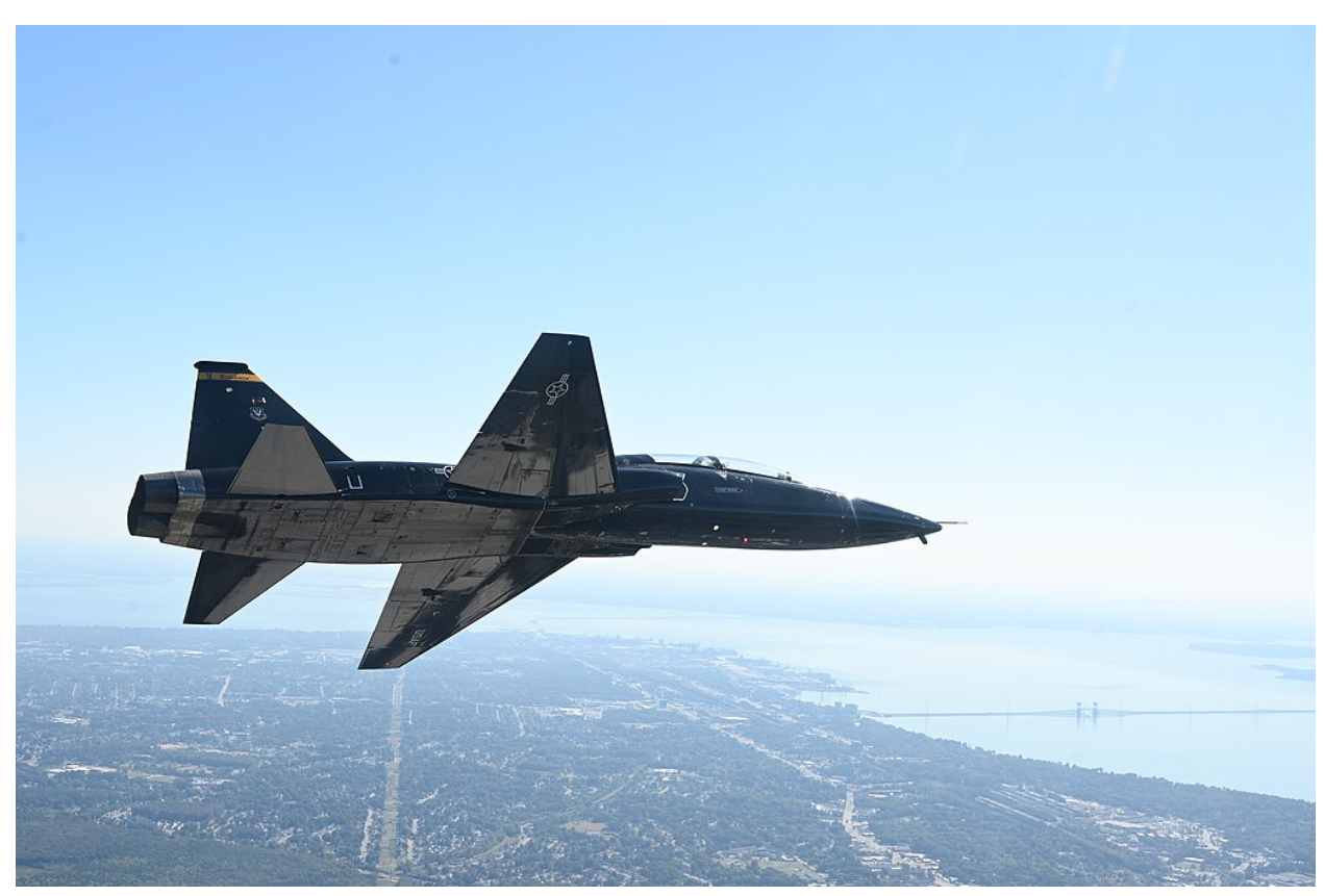
7 FTS AT-38