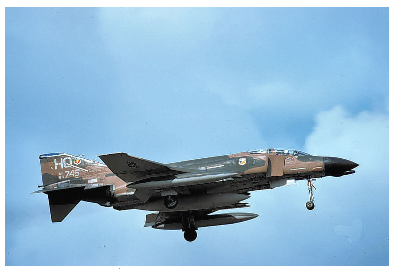
26 January 1976 Participated in operation BOLD EAGLE.