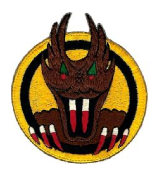
7 Fighter-Bomber Squadron emblems