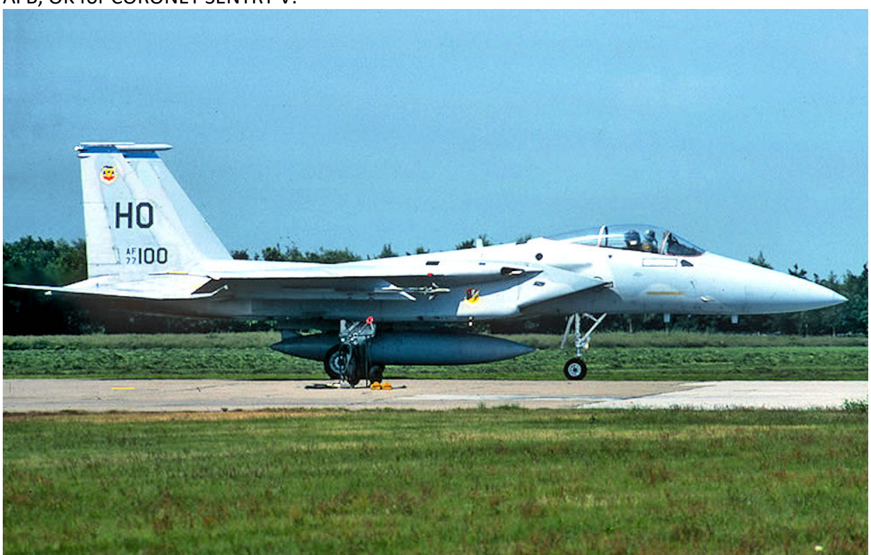
07 - 21 August 1982 The 49 TFW was the host unit for RED FLAG 82-5 being held at Nellis AFB, NV. The 7 TFS was a participant.

3rd Qtr 1981 Deployed to Lahr CFB, West Germany for CORONET SLOOP, deployed to Tinker AFB, OK for CORONET SENTRY V.